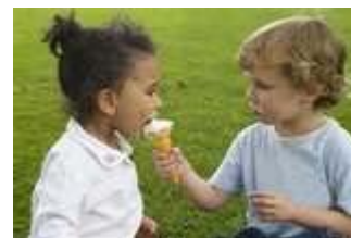
Share Some Today!!!

Most popular flavors? The 3 top flavors are vanilla , chocolate, and cookies&cream.